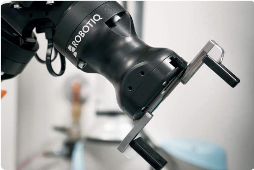
Extenders sold separately